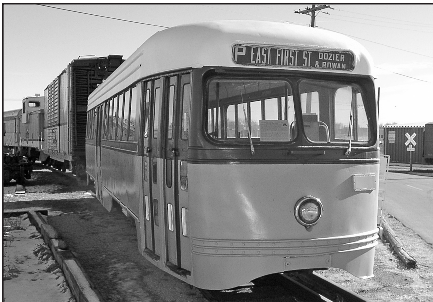
Los Angeles Railway PCC No. 3101