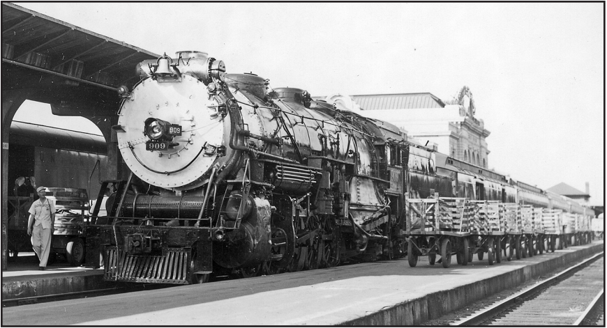
C&S 909 on a special train in Denver on June 30, 1957. The engine was a USRA 2-10-2, one of five the C&S had.