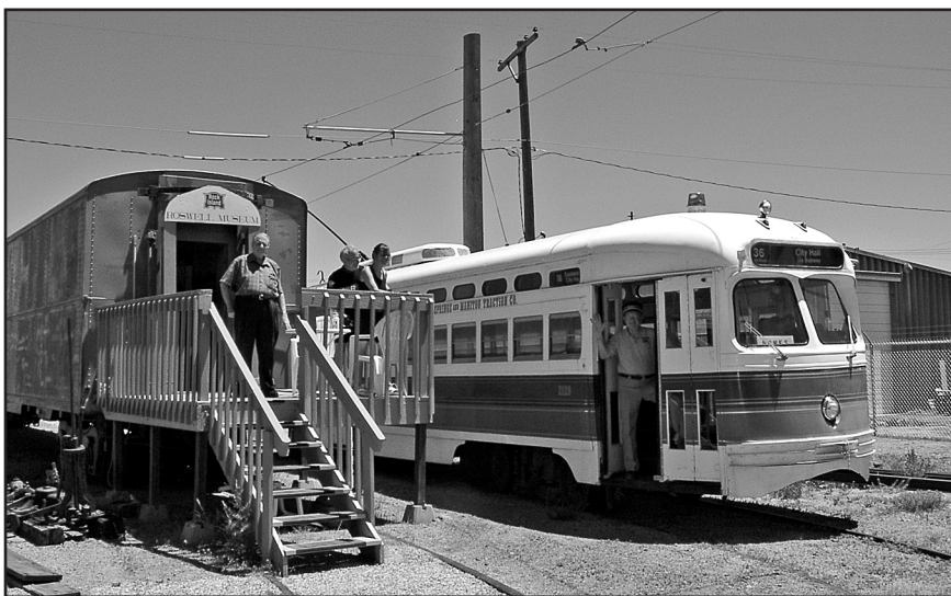
The museum's operating former SEPTA car No. 2129.