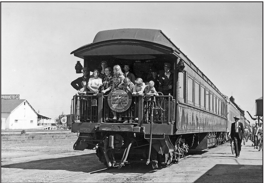
The RMRRC drumhead on the rear car of the C&S 374 trip to Owl Canyon and Windsor. The C&S excursion was at Fort Collins, Colorado, on May 30, 1951.