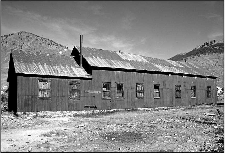
The Silverton Northern Railroad engine house in Silverton, Colorado, in 1978.

Engine #20 continues its restoration in Strasburg, Pennsylvania. The Colorado Railroad Museum recently received a challenge donation of $250,000 to help defray the costs of the restoration. They have received more than $50,000 in donations to meet the match, but still have a long way to go. As friends of the museum, we would like you to please consider a donation to the Locomotive 20 matching fund. You'll have the satisfaction of knowing that your contribution helped restore this important icon of narrow gauge railroad history. Please call the museum at 303-279-4591 or toll free at 1-800-365-6263 with your pledge of support, or you can mail a check to the Colorado Railroad Museum, 17155 W 44th Ave, Golden, CO 80403. It will be great to see this engine in steam again in a couple of years.