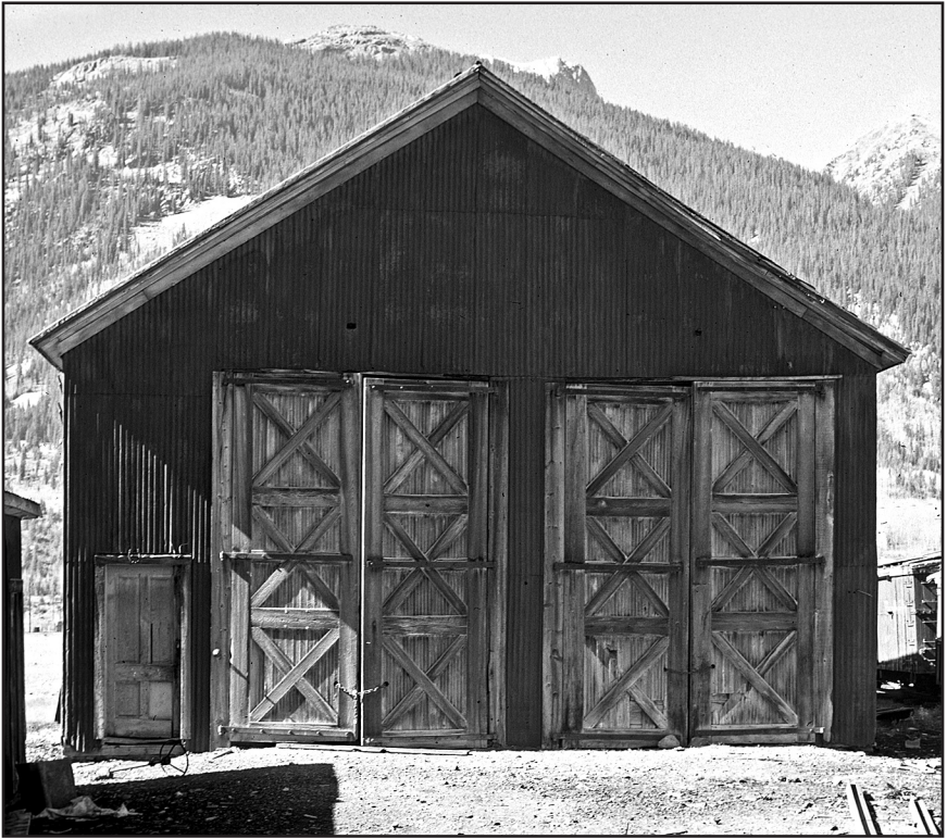
The Silverton Northern Railroad engine house doors in Silverton, Colorado, in 1978.

The Durango & Silverton Narrow Gauge Railroad owns the track that will connect with the engine house and be used during special occasions. The Galloping Goose Historical Society of Dolores (GGHS) is providing 2,000-feet of track on permanent loan. The estimated value of the rails, ties, joiners, plates, and spikes for 2,000 feet of track is $98,000 – the major savings in the cost of the project.