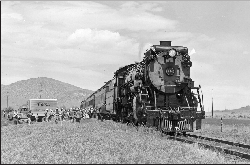
The Club's C&S 374 excursion during a refreshment stop near La Porte, Colorado, on May 30, 1951.